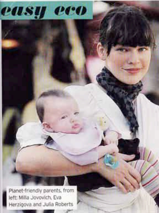
Planet-friendly parents, from left: Milla Jovovich, Eva Herzigova and Julia Roberts